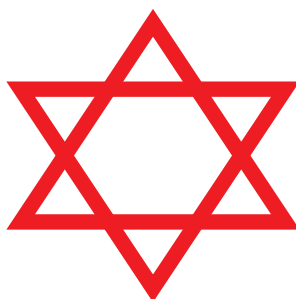
RED SHIELD OF DAVID