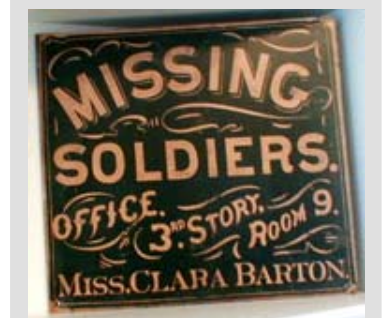
The American Civil War lasted from 1861 to 1865.

On May 21, 1881, Clara and a group of friends held the first meeting of the American Red Cross society in Washington, D.C. At the meeting Clara was chosen to be president of the society. She ran the organization for the next 23 years, leaving in 1904 at the age of 83!