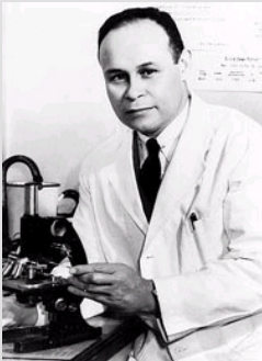
Across the country, schools bear the name of Dr. Charles R. Drew as a tribute him.

The Red Cross blood program started as a relief effort to provide lifesaving plasma and blood during World War II. The American Red Cross collects and distributes nearly half the nation’s blood to hospitals.