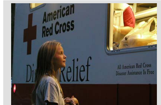
Red Cross Chapters are local offices that provide disaster relief, training and other services in communities across the United States.

The American Red Cross disaster response to the people affected by a series of hurricanes between August and October of 2005—providing emergency food, water and shelter during and after the storms—was the largest response to a natural disaster in the organization's 125 year history.