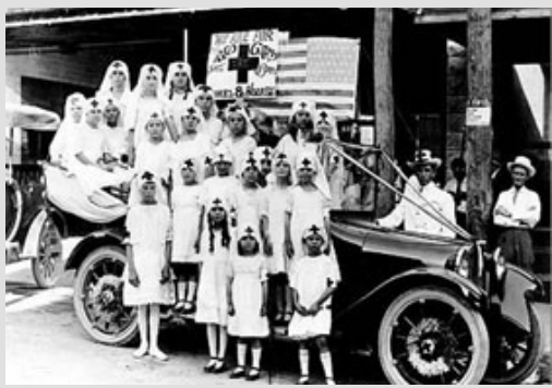
Junior Red Crossers in Texas during World War I. Today the Junior Red Cross members are called American Red Cross Youth Volunteers . Contact your Red Cross chapter to get involved.

During World War I and World War II school-aged volunteers called the Junior Red Cross helped the military by making hand-crafted games and other items like knitted mufflers. Today the Red Cross Armed Forces Emergency Services (AFES) continues the tradition of providing services to U.S. forces and their families wherever they are.