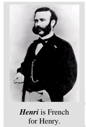
Henri is French for Henry.

When he returned to his home town of Geneva, Switzerland, he wrote a short book about his experiences caring for the soldiers in Italy. He titled his book A Memory of Solferino , naming it after the town where the battle took place. The book contained an important idea that would change the world. In it Henri suggested there should be trained volunteers ready at times of crisis to help the injured no matter what nation they were from. That little book with the big idea was a great success and, at a meeting of a Geneva charity in 1863, Henri and four other men set up an organization to help wounded soldiers—it became the Red Cross.