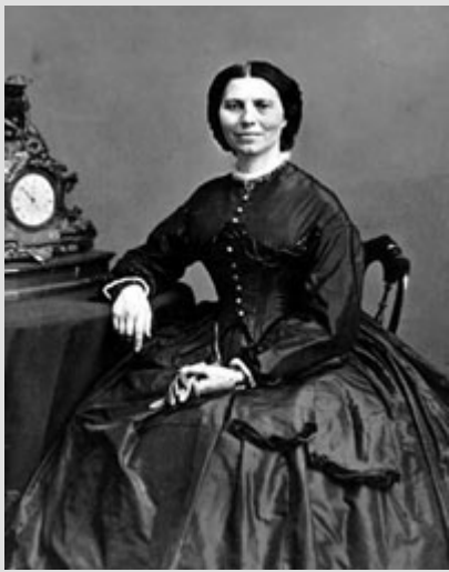
Clara Barton was 60 years old when she started the American Red Cross.