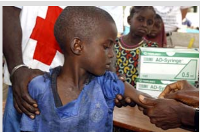
A vaccine is a special type of medicine that protects your body from a disease.

A famine happens when farmers cannot produce enough crops to feed everyone.